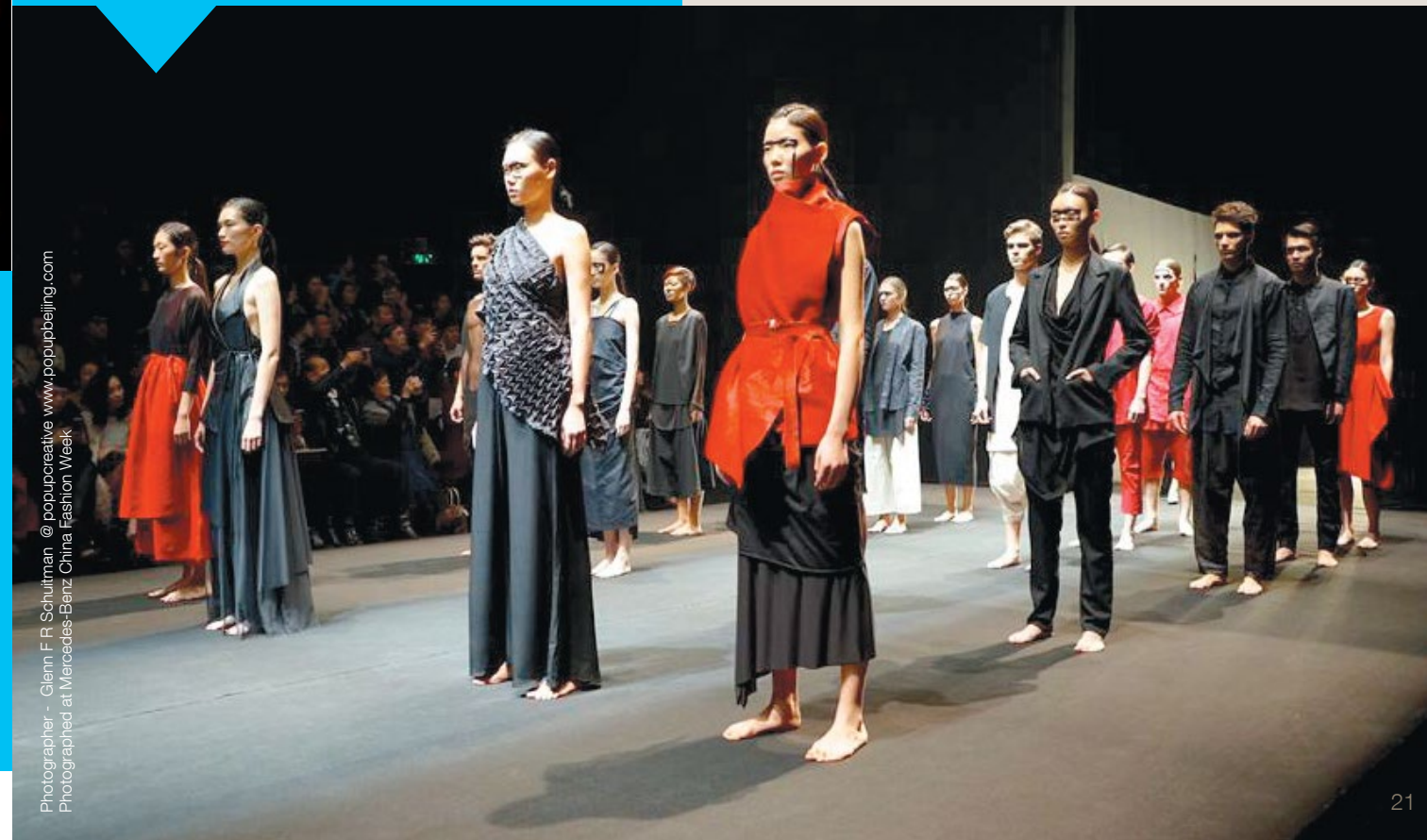
Photographed at Mercedes-Benz China Fashion Week